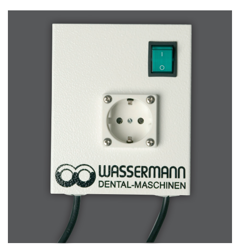
Automatic starting device AS-100, available as accessory