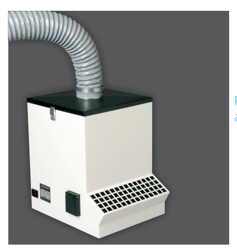
PVC-hoses available as accessories