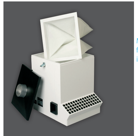
Micro fine dust filterbag included in delivery