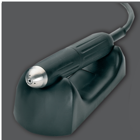
Extremely powerful motor handpiece with a constant speed and very low noise