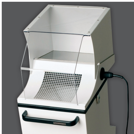
Timobil with accessory extractor hood